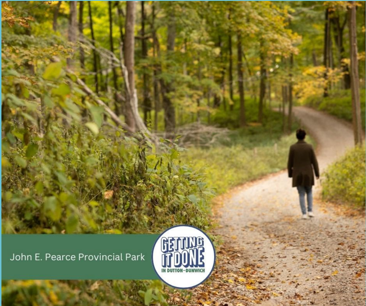
John E. Pearce Provincial Park

“Strengthening our Municipality through Creation, Partnership and Community”